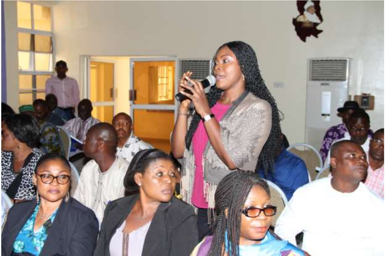
A participant makes a point during one of the interactive sessions at the NDIC 2014 Workshop for Finance Correspondents Association of Nigeria (FICAN) in Katsina.