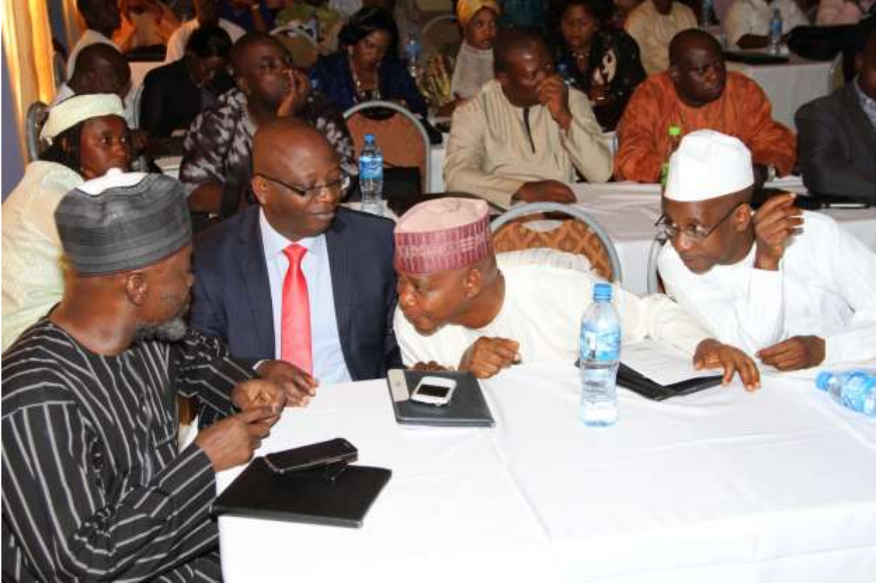
A cross section of resource persons and participants at the NDIC 2014 recently concluded Workshop for Business Editors and Finance Correspondents in Katsina.