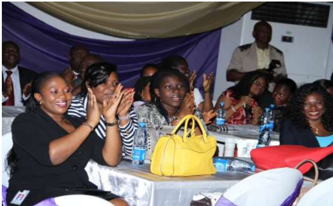
A cross section of participants at the Abuja run of the NDIC Management 's Parley with the Female Staff.